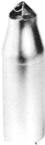
Model No. 1LTR-2.5X10LG