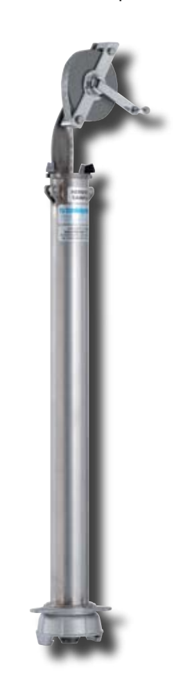
2 Inch connection