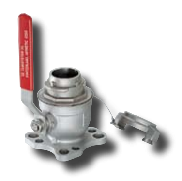
HERMetic Compact valve C2-SS-BL