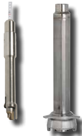
Visc version Storage tube SS2-Q2

Sensor fitted with additional load, recommended for operation in high viscous products.