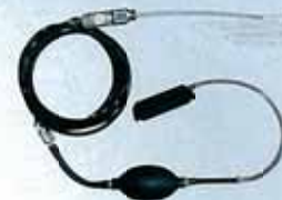
Hand aspirator sampling kit