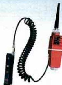
Pump unit Model RP-6