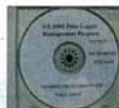
GX-2009 data logger management program