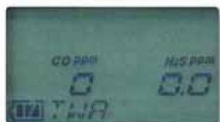
▲ TWA screen