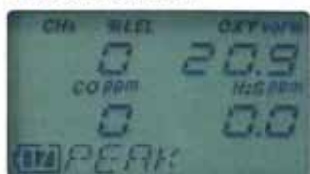
▲ Peak screen