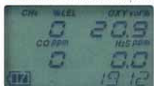
▲ Normal measurement